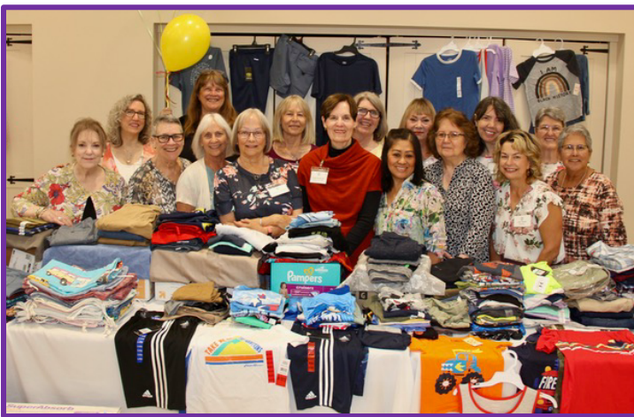
Spring Shower of Love 2024 Committee

And... Thank you to the "Shower of Love" team and their spouses who donated their time and talents to make this "Shower of Love" a great success!